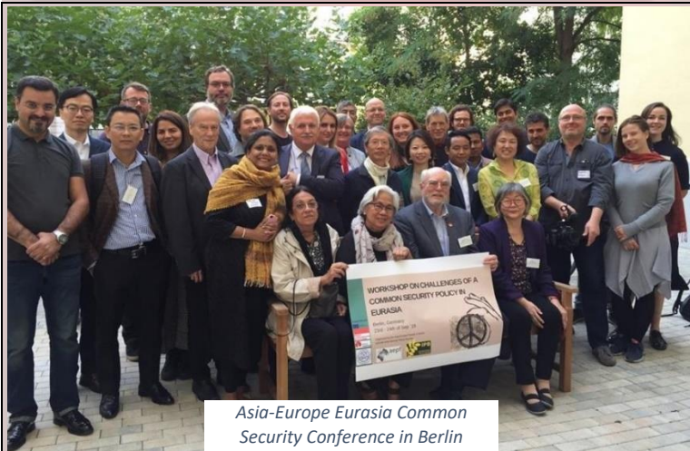
Asia-Europe Eurasia Common Security Conference in Berlin