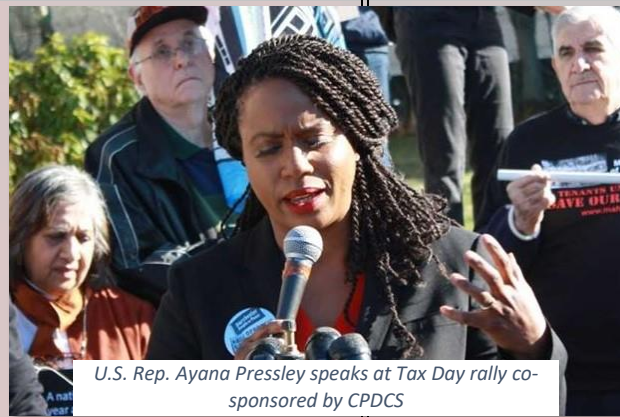
U.S. Rep. Ayana Pressley speaks at Tax Day rally co-sponsored by CPDCS