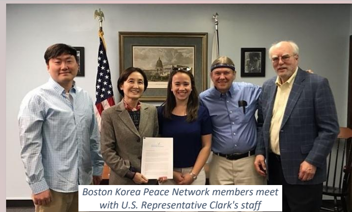
Boston Korea Peace Network members meet with U.S. Representative Clark's staff

Humanity Faces Two Existential Threats: The Increasing Dangers Of Nuclear War And Climate Disruption. Human Beings Created These Threats, Which Can Only Be Reversed By Mass Popular Actions.