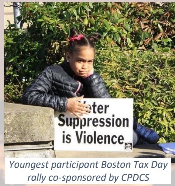
Youngest participant Boston Tax Day rally co-sponsored by CPDCS